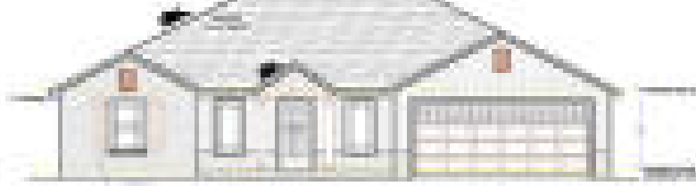
FRONT ELEVATION 1000 1000 1000