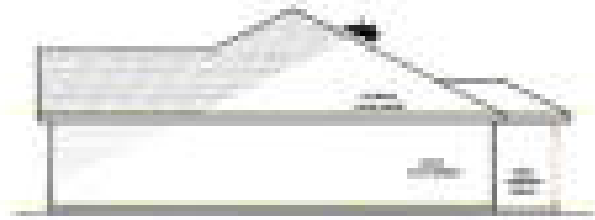
LEFT SIDE ELEVATION BASE 10'0" x 24'0"