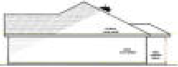
LEFT SIDE ELEVATION 1000 1000 1000