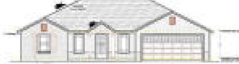
FRONT ELEVATION BASE 10'0" x 24'0"